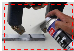
4. Spray SM-15 (black Magnetic particle)