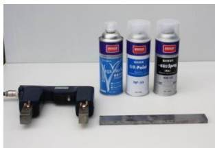
Testing Equipment & Magnetic particle Detecting Spray