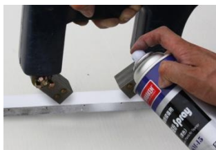
3. Forming the magnetizing current magnetic field