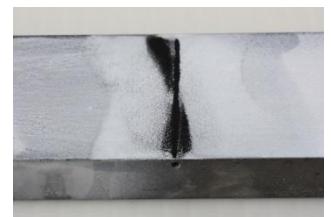
5. Examine the defective area with naked eye