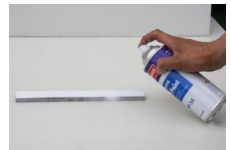
2. Spray MP-35 (White Paint)