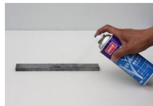
1. Cleaning of Testing Object