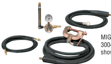
MIG kit 300405 shown.

300408 For single or dual feeders Holds two large gas cylinders and has gun cable hangers and a consumable drawer in front. A convenient handle allows the cart to be pulled easily through doorways. Power source and single or dual feeders can be mounted to cart and secured.