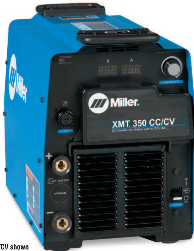
XMT 350 CC/CV shown

With multiprocess capabilities and features like Auto-Line, the XMT 350 is portable and versatile for applications from jobsites to the factory floor.