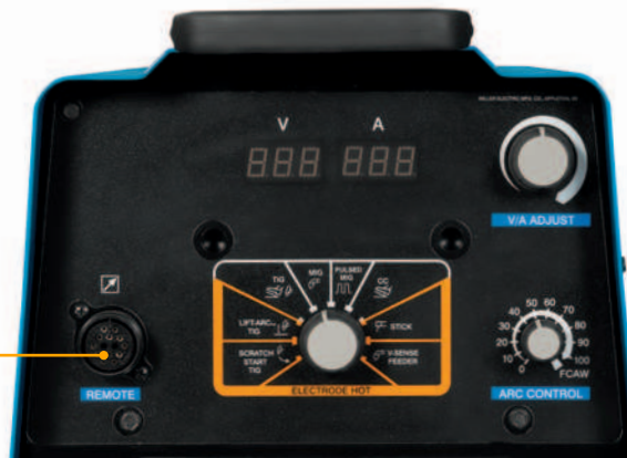
XMT 350 CC/CV panel shown

Lift-Arc™ provides arc starting that minimizes contamination of the electrode and without the use of high-frequency.